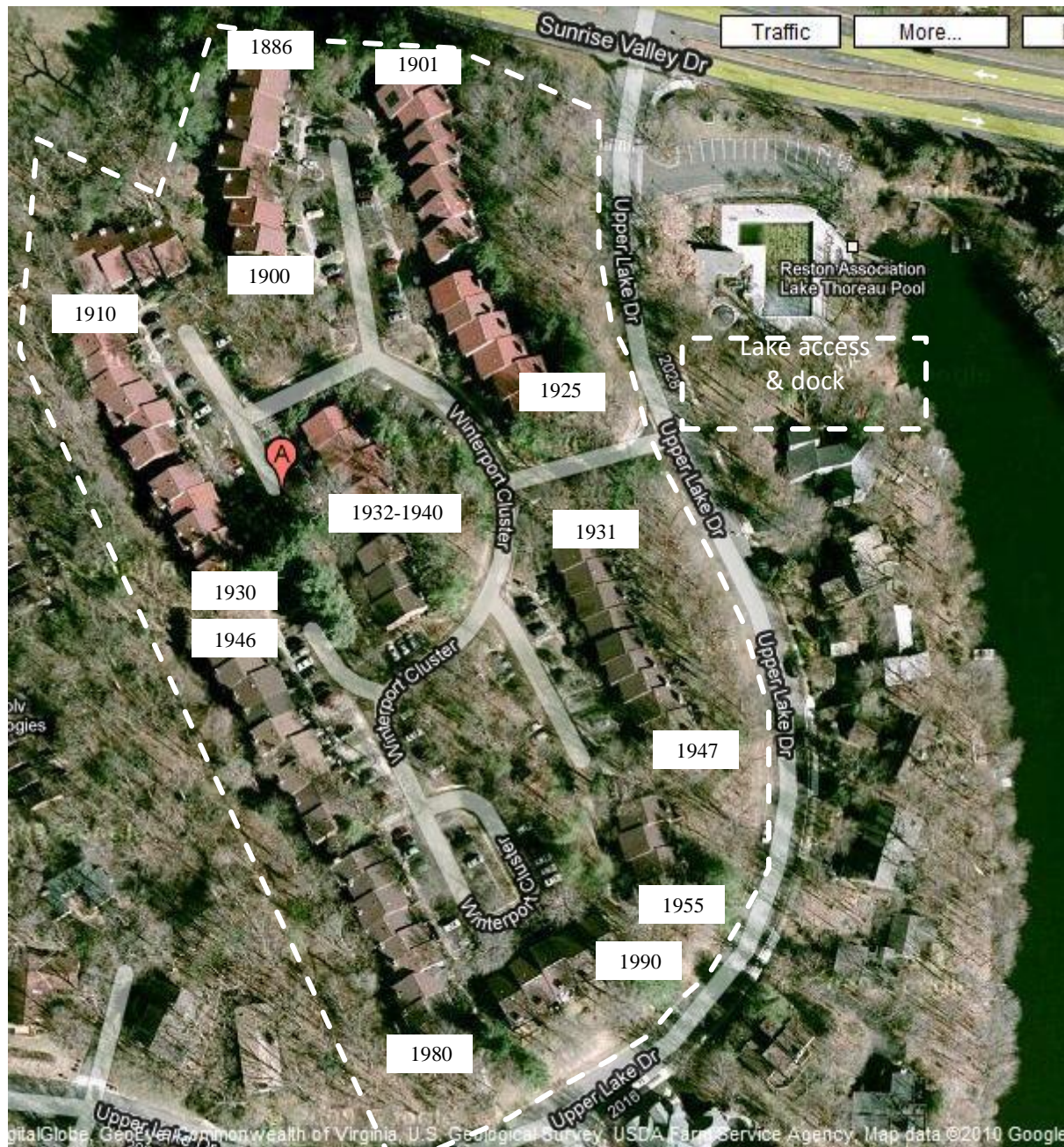
Figure 1. Aerial view of Winterport Cluster with addresses and approximate boundaries.